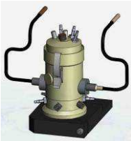
Colorimetry / Titrimetry