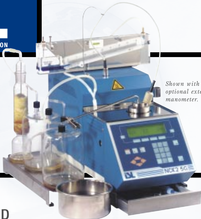
Shown with optional external manometer.